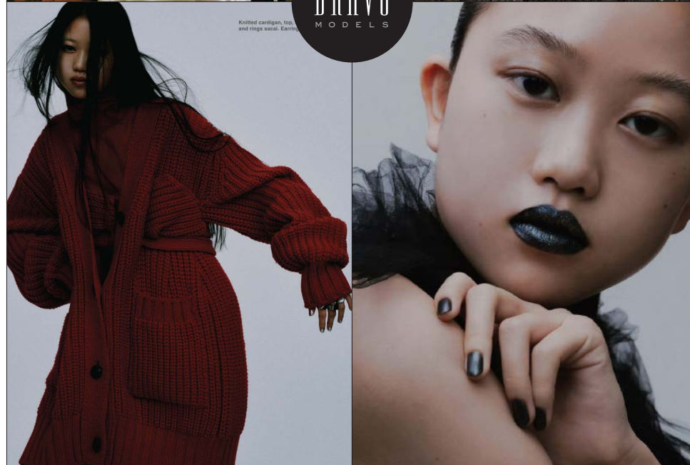
Knitted cardigan, top, and rags sacal. Earrings

HILLSIDE TERRACE H-301 18-17 SARUGAKUCHO SHIBUYA TOKYO 150-0033 JAPAN PHONE 03.3463.9090 / FAX 03.3463.9901 WWW.BRAVOMODELS.NET