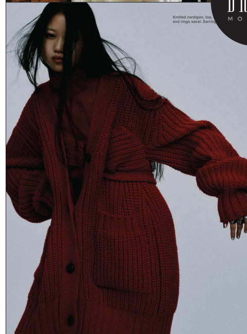
Knitted cardigan, top, and rags sacai. Earrings