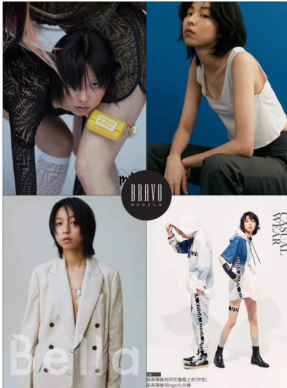
LE 箱高彈幾何印花連帽上衣(中性) 箱高彈幾何logo九分褲

Height 175 Bust 79 Waist 60 Hips 89 Shoe 24 Eyes dk brown Hair black