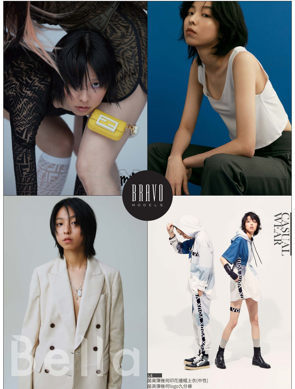
LE 箱高彈幾何印花連帽上衣(中性) 箱高彈幾何logo九分褲

Height 175 Bust 79 Waist 60 Hips 89 Shoe 24 Eyes dk brown Hair black