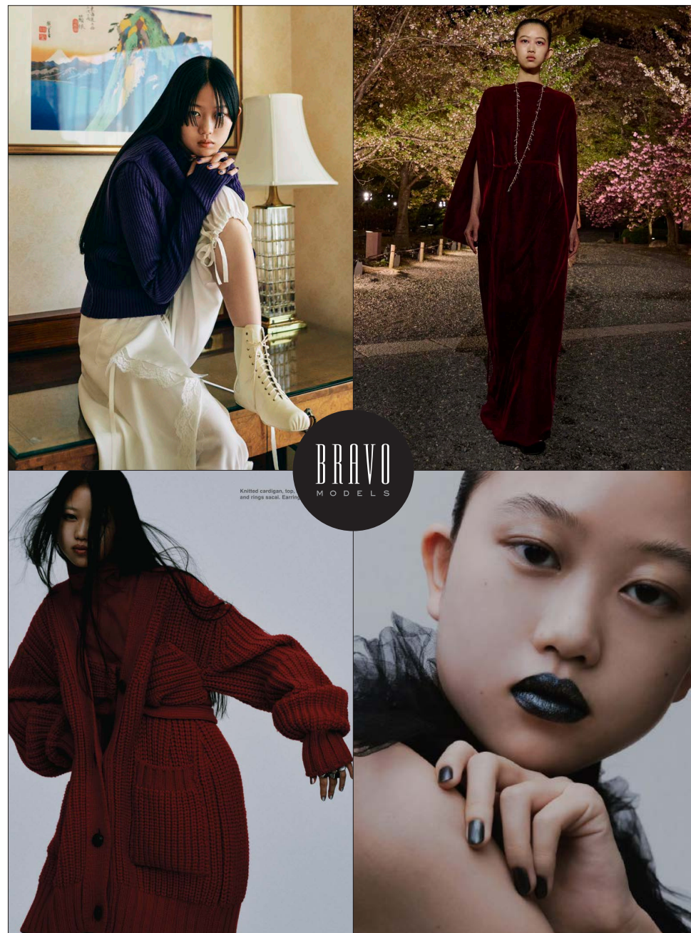
Knitted cardigan, top, and slugs sacal. Earrings

Height 175 Bust 75 Waist 59 Hips 89 Shoe 24 Eyes Dk Brown Hair Black