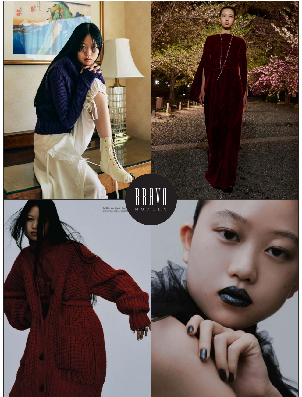
Knitted cardigan, top, and rags sacal. Earrings

Height 175 Bust 75 Waist 59 Hips 89 Shoe 24 Eyes Dk Brown Hair Black